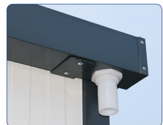
Rear Roof Rain Gutter System