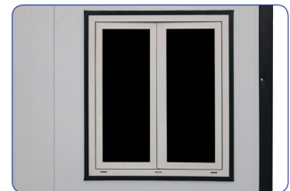
One Window Kit Included