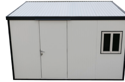
Roof Top View