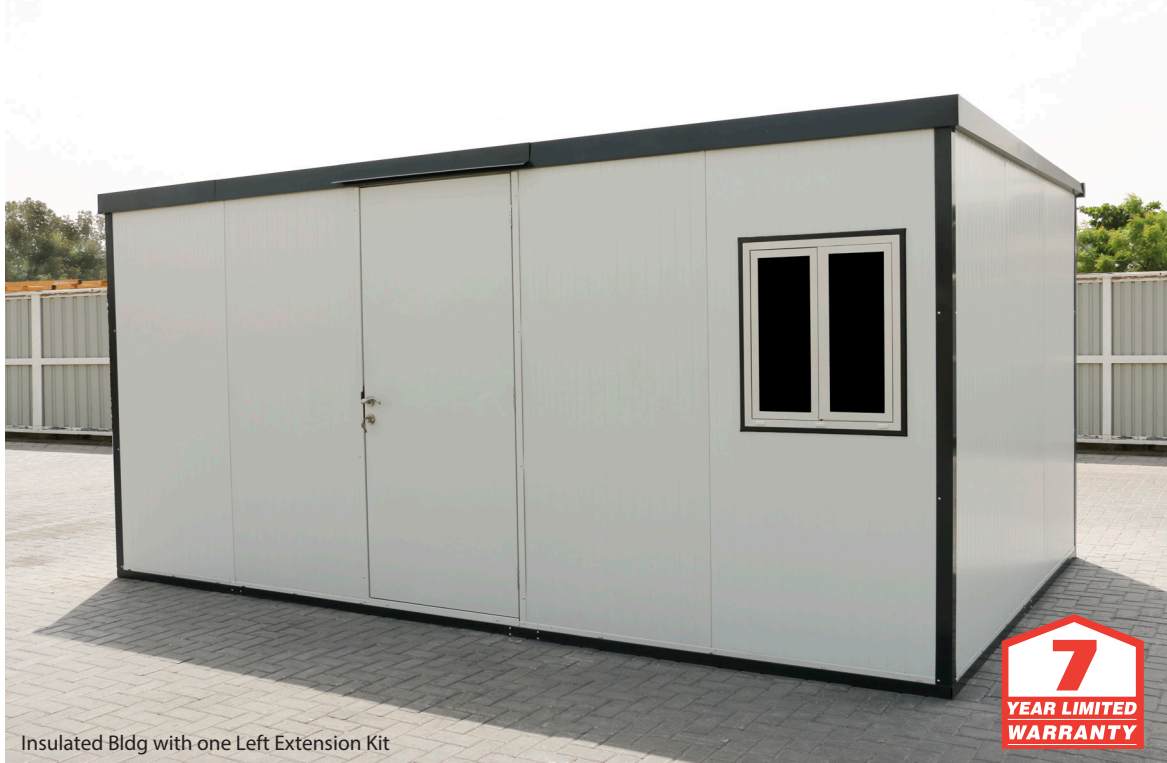
Insulated Bldg with one Left Extension Kit