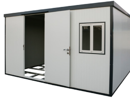
Right Angle View