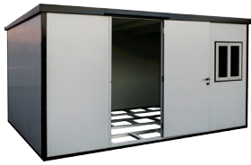
Left Angle View