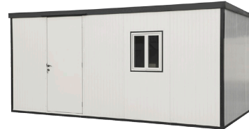
With One Right Extension Kit Added