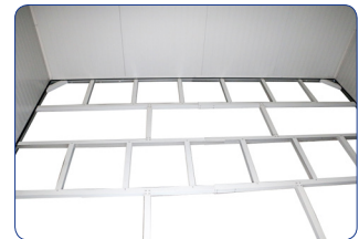
Galvanized Metal Foundation Kit Included