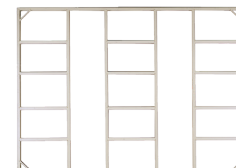
10x8' Foundation Kit (07200) Foundation Kit Size varies to the type of shed