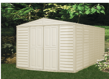
10.5' x 13'