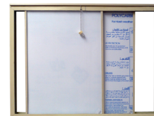
Window Kit (08211)