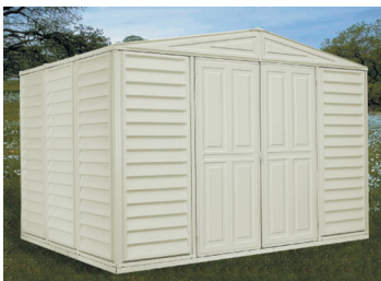
10.5' x 8'