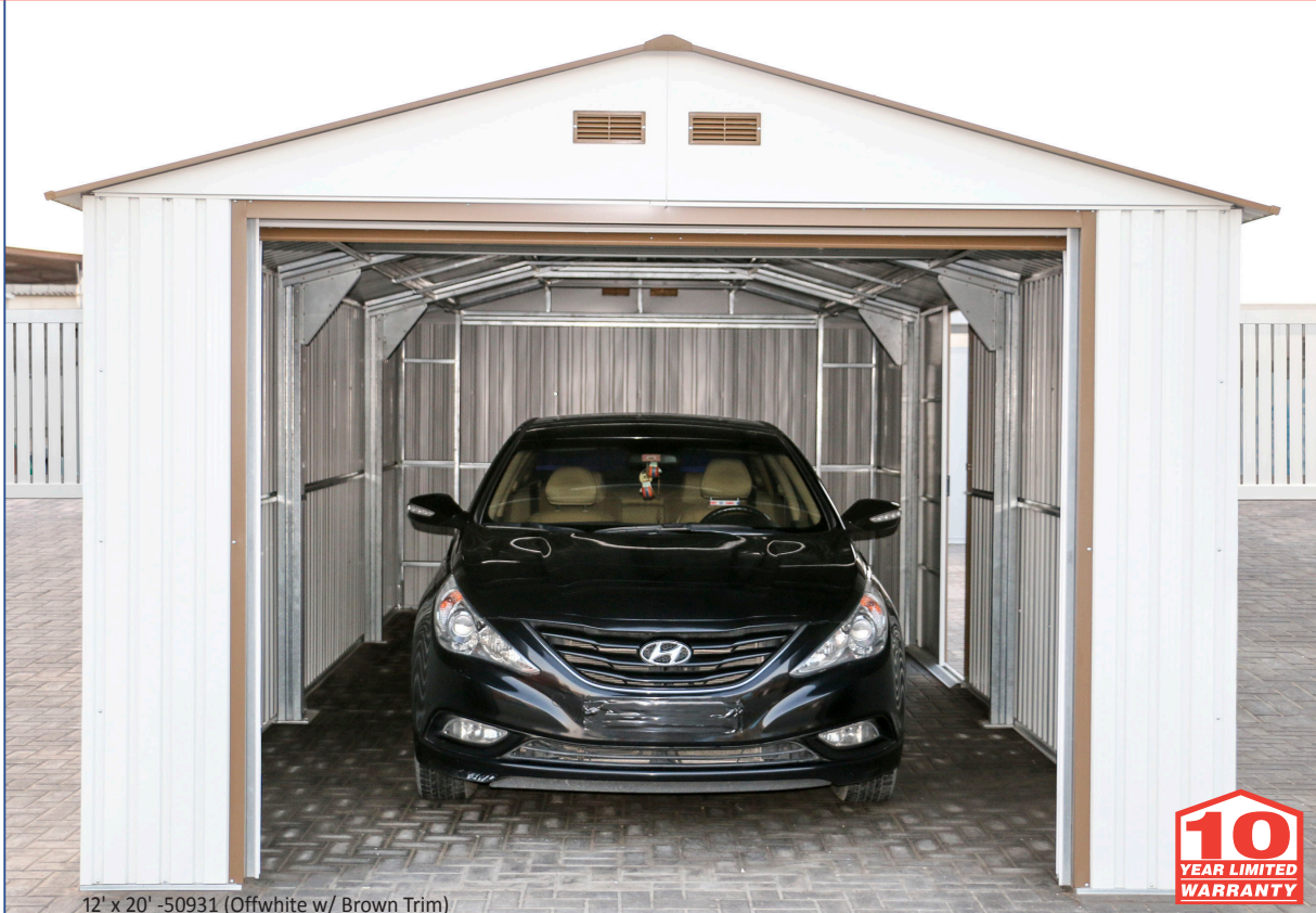
12' x 20' -50931 (Offwhite w/ Brown Trim)