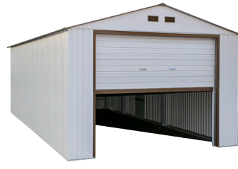
12' x 26'