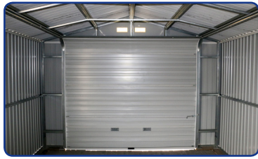
Inside Front View