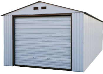
12' x 26'