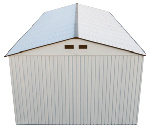
12' x 26'