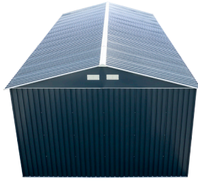
12' x 26'