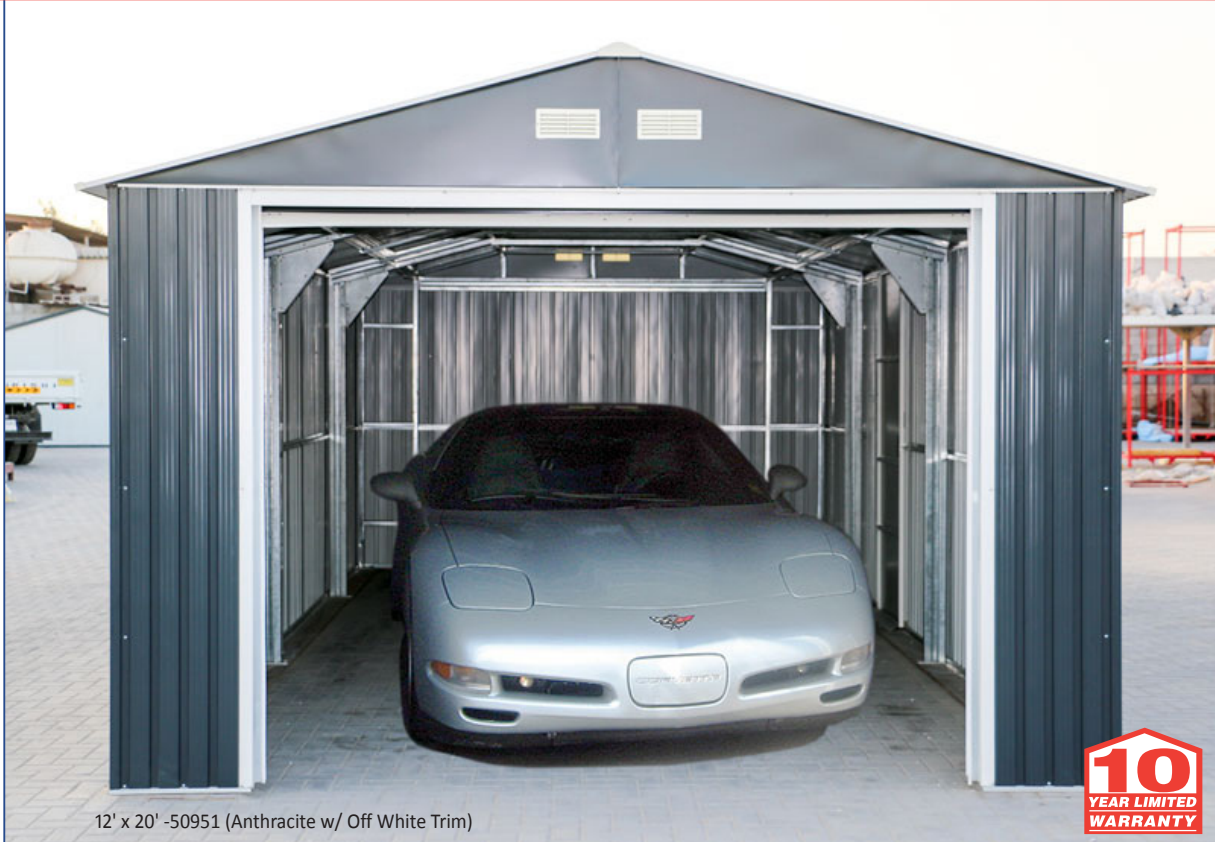
12' x 20' -50951 (Anthracite w/ Off White Trim)