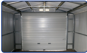
Inside Front View