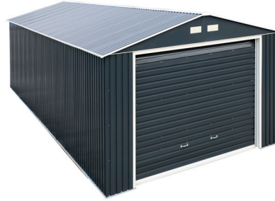
12' x 26'