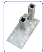
Ground Anchor is made of Heavy Duty Solid Steel Construction