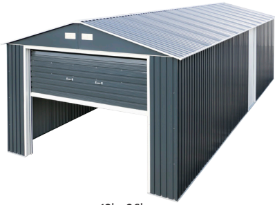
12' x 26'