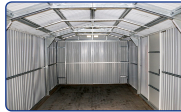
Inside Back View

Heavy Reinforced Galvanized Steel Roof Trusses, Beams and Wall Support