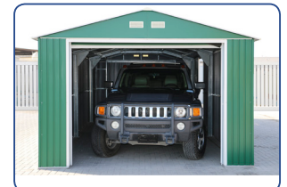
Available also in Green with Off White Trim & Off White with Brown Trim