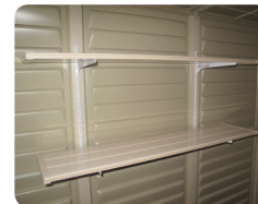
12x50"=Shelf Kit (08632)