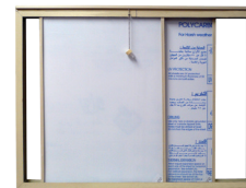
Window Kit (08211)