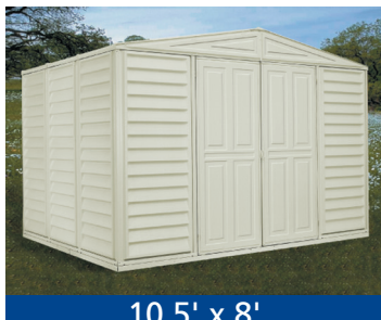
10.5' x 8'