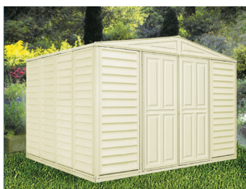
10.5' x 10'