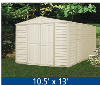
10.5' x 13'