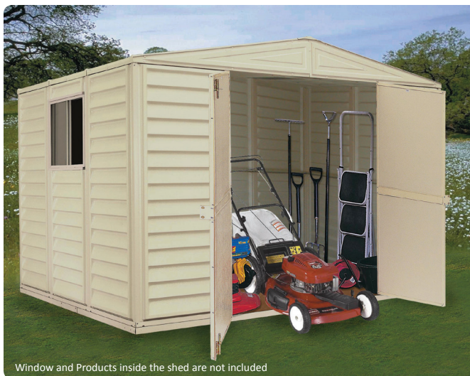
Window and Products inside the shed are not included