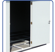
Wide door opening