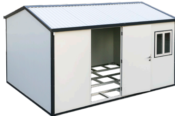
Front Door Open