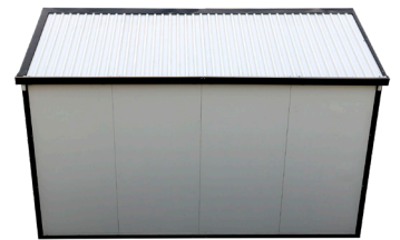
Back Side Panel & Roof View