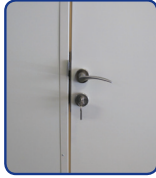
Door handle with dead bolt lock