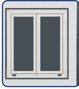
One double pane window included