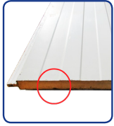
Roof & side panels are fire-retardant PU insulation