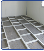
Foundation Kit Included