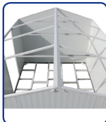
Reinforced w/ metal columns & beams