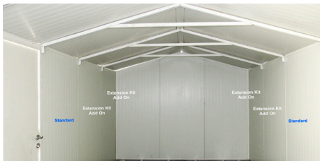
Gable Roof with two extension kits