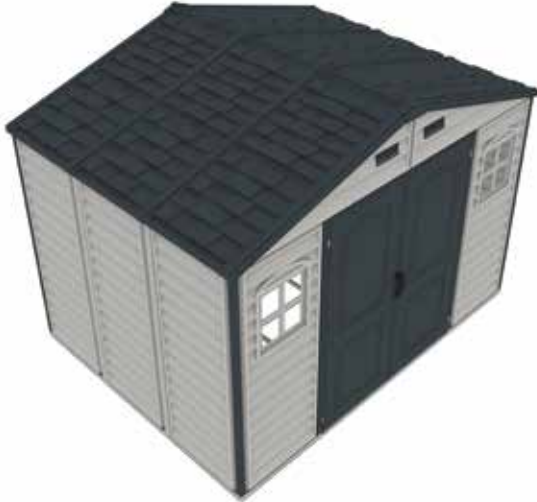
10.5' x 8' WoodSide Plus